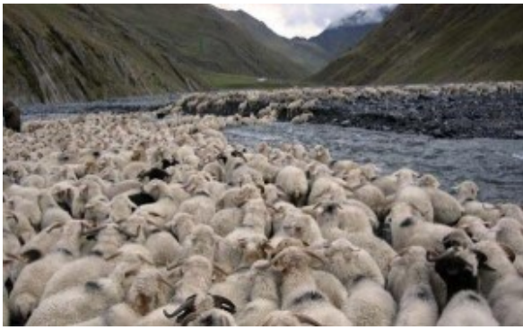
Sheep crossing the Alazani River, Georgia